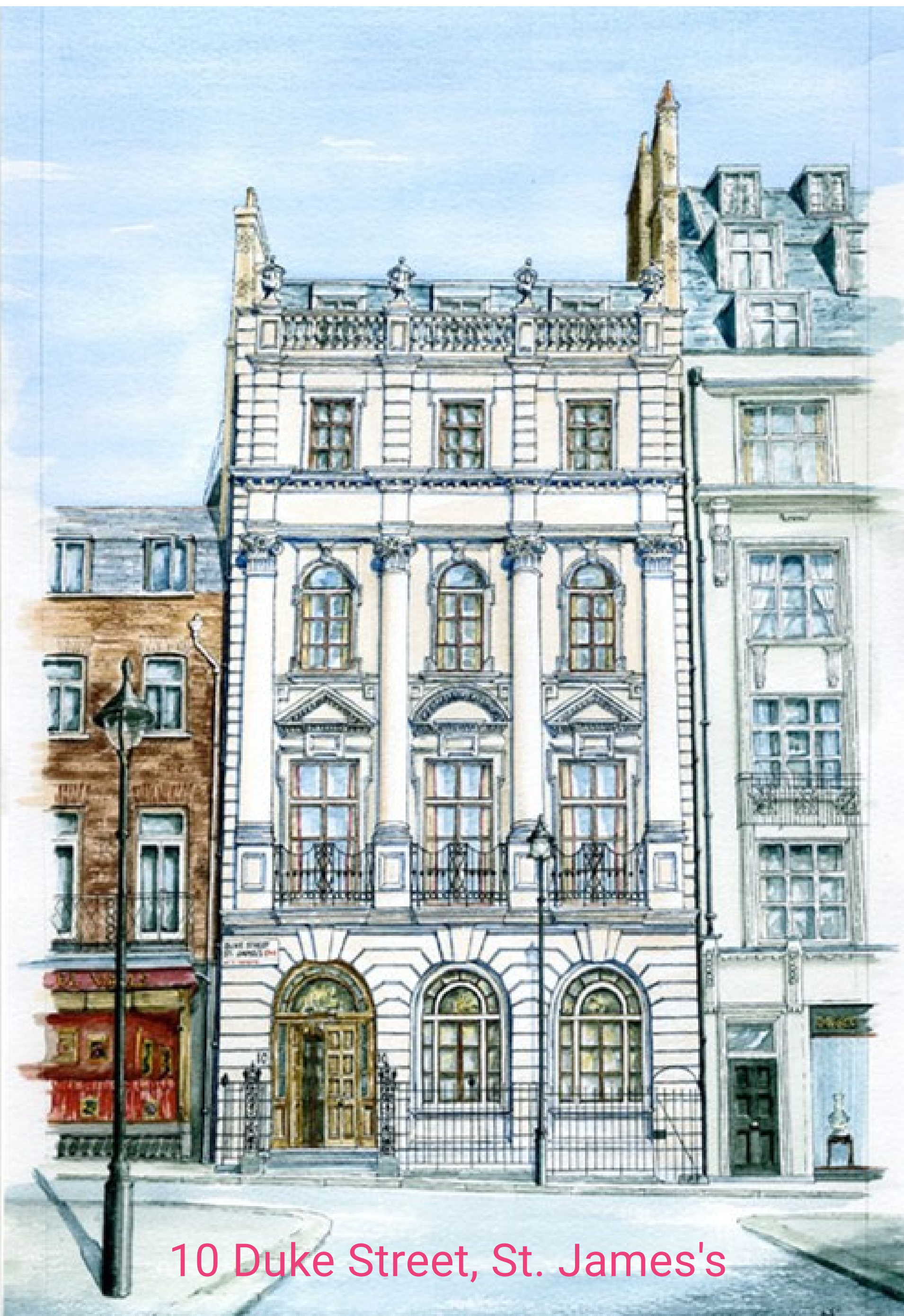
10 Duke Street, St. James's

The sovereign power of the Ancient & Accepted Rite in England and Wales is committed to a Supreme Council consisting of nine Sovereign Grand Inspectors General.